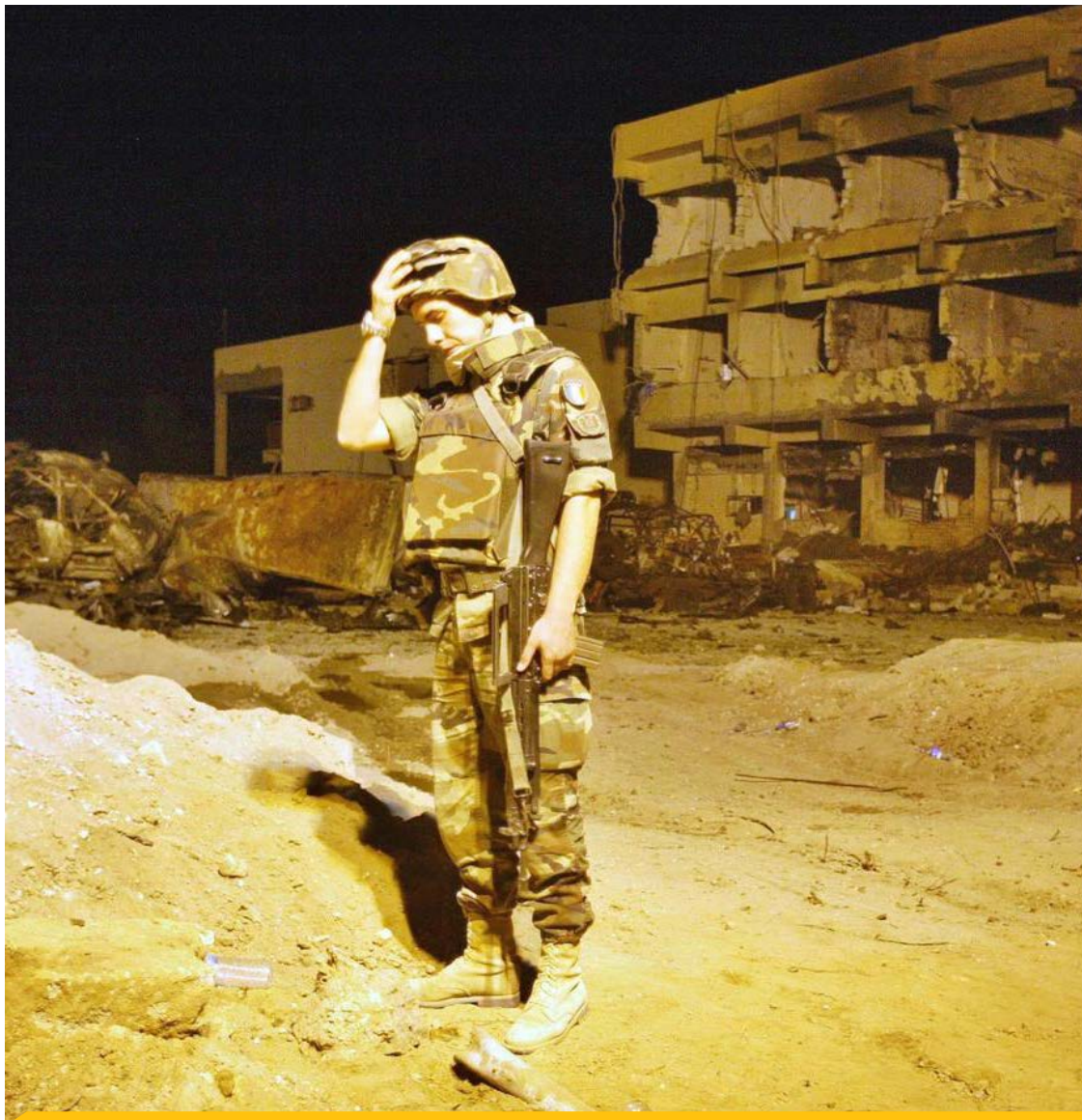
Italian soldier in distress following the Nassiriya’s massacre