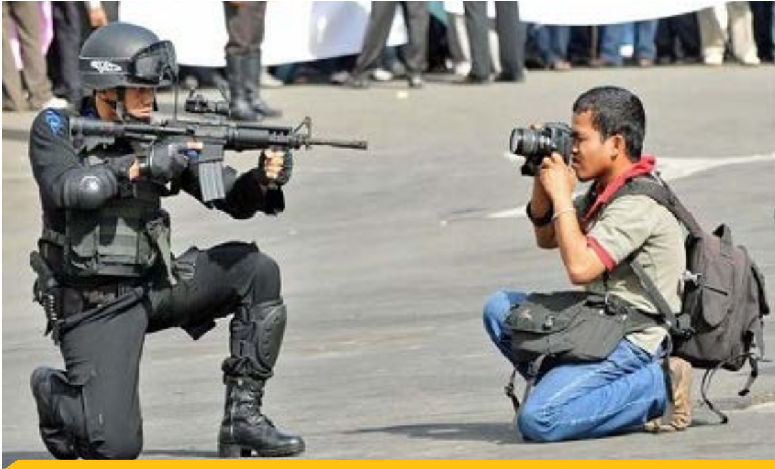
Press photographer at a demonstration