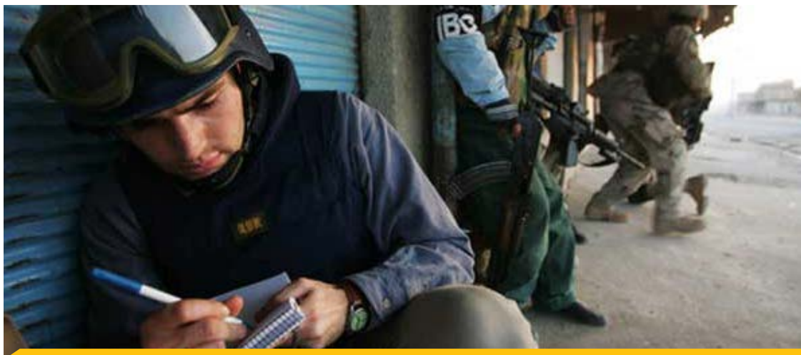
Journalist on a war front