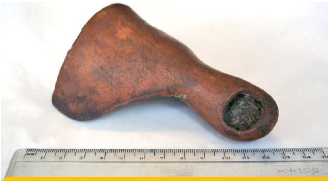
Figure 1: The Greville Chester toe

The first documented examples of prosthetics date back to around 1500 B.C. in Egypt. 2 Although the Egyptians prioritised psychological integrity over the physical functionality, a few prostheses resembling basic articular functions have been found on mummies in that period. For example, the so-called “Greville-Chester toe” was created in 600 B.C through the “Cartonnage” technique (papier-maché made of linen and soaked with animal glue, covered with painted plaster) and was also decorated with a false nail. This toe, which is considered to be one of the first working models of prosthesis, shows holes and signs indicating that it could have been attached to the foot, a sock or a sandal. 3