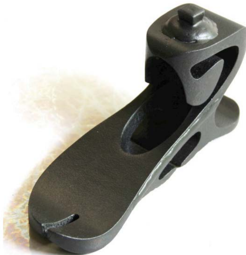
Figure 3: #2 prosthetic prototype printed at the Swinburne University of Technology, compatible to the SACH model and analysed to wear a shoe.

Some researchers have argued that 3D printing could be a degrading solution that may detract attention and investment from the improvement of more traditional prostheses. Nevertheless, researchers have demonstrated that a prosthetic foot created with a 3D printer, which costs 12 USD for the purchase of the materials, has the same, or even better, performance of a SACH model, 20 that is commonly used in the developing countries. 21 This research is based on an artificial limb made of polylactic acid (or polylactide, PLA) printed with the Makerbot Replicator 2 (the RepRap advanced version, which is not considered a professional machine). This experimentation showed that this technique permits rapid iterations that allows basic tests based on the autoethnographic method and the possibility to produce and modify the artificial limb in loco and adjust it to different needs. Subsequently, orthopaedic technicians would be able to adapt the prosthesis to the patient's necessities even in a context with limited resources.