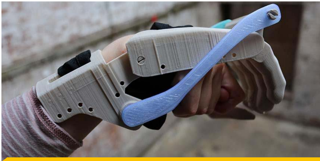
Figure 4: Prosthetic model entirely 3D printed.

Some experts argue that 3D printing isn't sustainable in rural areas characterised by a lack of technology and hardware. Open-source 3D printers have made the design phase more accessible, but it is still difficult to find materials such as pivots, screws and laces. The NGO Field Ready had to face this problem when it reached Haiti in 2010 after the tragic earthquake: in order to bypass the lack of an appropriate supply chain, it collaborated with another NGO Bold Machines to create a prosthesis that doesn't need screws, bolts or mounting tools. 30 Following its success, the organisations addressed the enthusiastic global prosthesis community, adopting an open license and sharing the original design of Jose Alves da Silva. Thanks to the support of Humanitarian Innovation Fund, Field Ready had the chance to cooperate with local groups, such as Haiti Communitere, Ti Kay Haiti, e MamaBaby Haiti whose aim is to transform the prosthesis in a disposable but recyclable item.